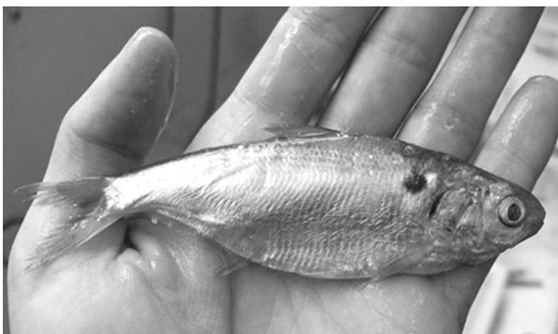
Hand dipping for gizzard shad such as this one begins in streams across Lower Peninsula this weekend.

All other waters are closed to these activities. Full season details, as well as descriptions of dip netting and hand netting, are available on page 23 of both the